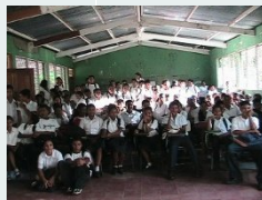
Primary School of Merida