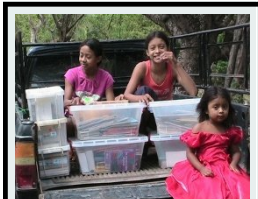
Community Library and Book Mobile of Santa Cruz